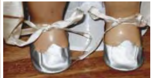
Ballerina

This is the brochure which introduced the Patty-Jo doll and documented the inclusion of Jackie Ormes; Mrs. Ormes signed a contract with TL Inc. on August 23, 1947 which was to run until Jan. 1, 1950. Whereas the carousel box showed Bonnie Lou and Benjie, the sales brochure pictures Patty-Jo and Benjie. Notice that the two dolls are composition