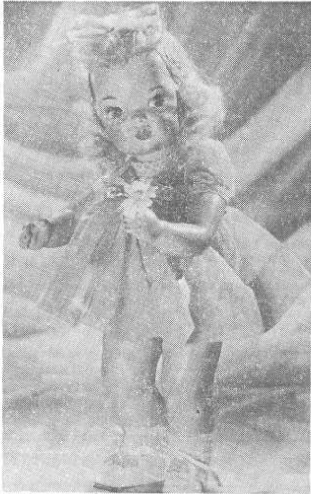
Terri Lee Dolls are believed to be the only dolls manufactured in Lincoln.