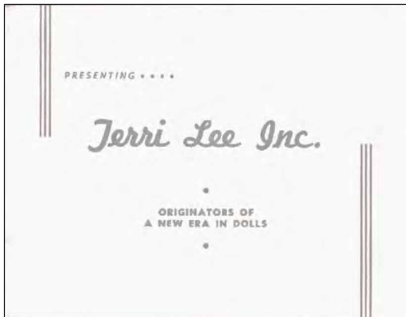
Cover at left

What follows is the complete 1947 Sales Brochure. All pages in the brochure were black and white with exception of red cover, inside front cover and back cover & the Carousel lid photo.