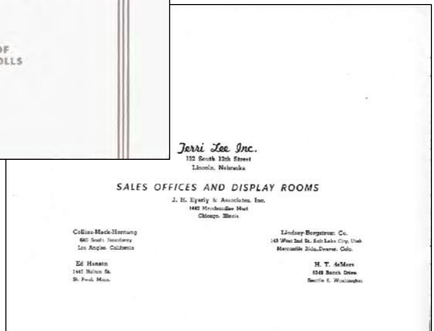
Inside cover below

Both would be bright red background with gray type